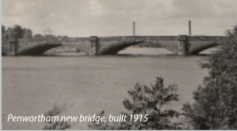
Penwortham new bridge, built 1915

This walk covers part of Higher Penwortham and includes sites dating from the Norman Conquest to the 20th century.