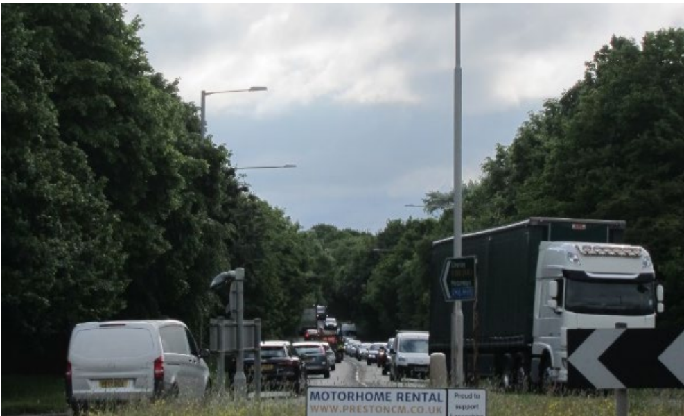
Photo 16: PM, Croston Round Roundabout to and from Stanifield Lane traffic queuing in both directions.