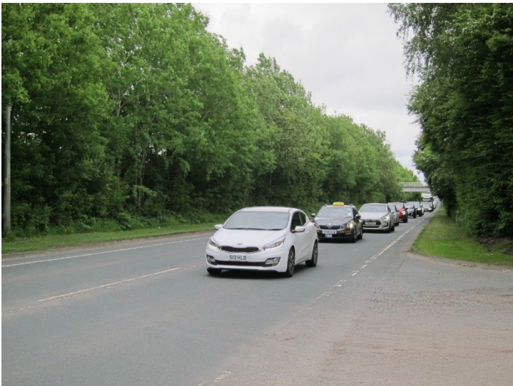
Photo 13: PM, Brook Lane (G S U Landscapes), looking South down A582 Penwortham Way towards Tank Roundabout.