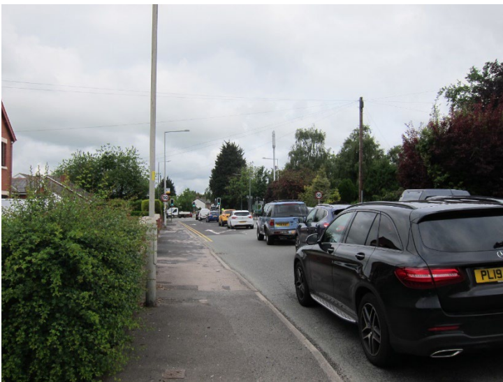
Photo 10: PM, Chain House Lane view towards A582 Junction from the East.