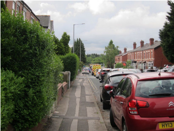
Photo 7: AM, Looking South down Watkin Lane (B5254 – becomes Leyland Road further North) to the A582 Stanifield Lane Junction.