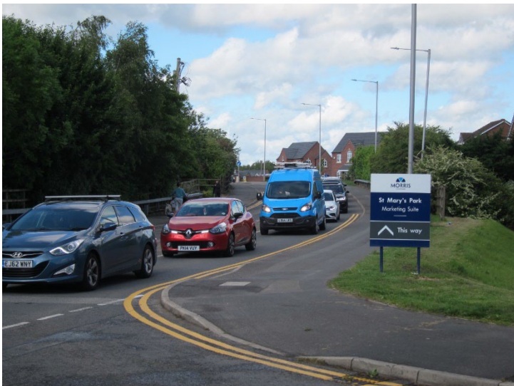
Photo 3: PM, Looking East from Handshaw Drive, queuing beyond the junction with The Cawsey.