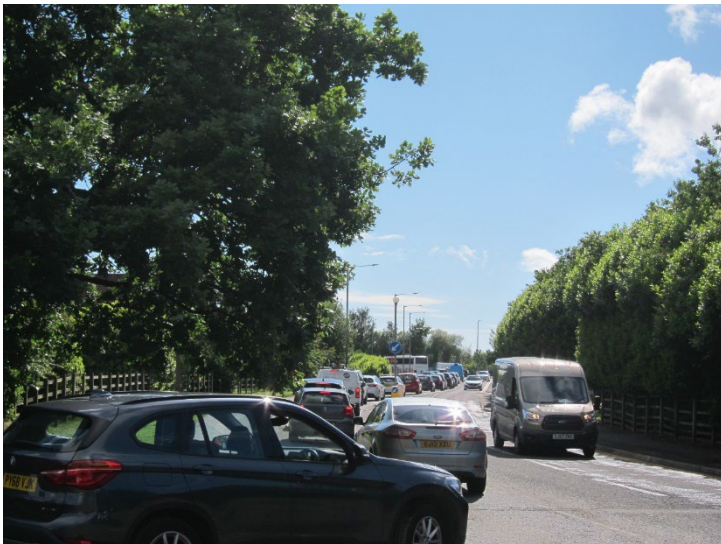
Photo 2: PM, The Cawsey, Car exiting Handshaw Drive 225m back from the Bee Lane/Leyland Road/The Cawsey Roundabout.