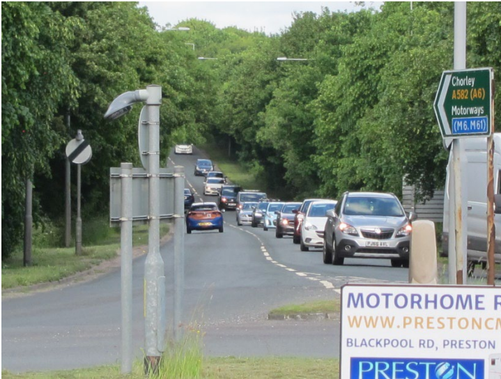
Photo 4: PM, Queuing traffic towards the A582/Croston Road Double Roundabout on the A582. Queuing/slow moving traffic coming from the Stanifield Lane junction.