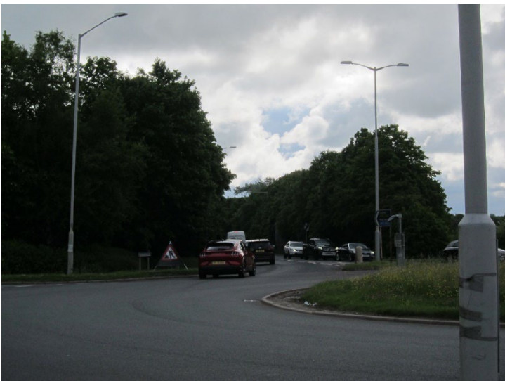
Photo 14: PM, Croston Round Roundabout queue extending back from Stanifield Lane/A582 junction for the full length.