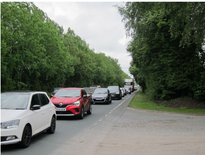
Photo 11: PM, A582 queuing traffic back from Chain House Lane extending back to the Tank Roundabout (Photograph taken looking South).