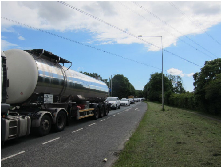
Photo 5: PM, queue to Stanifield Lane Roundabout extending back beyond the Industrial Estate off Sherdley Road. This queue goes back over the WCML rail bridge to the A582/Croston Double Roundabout.