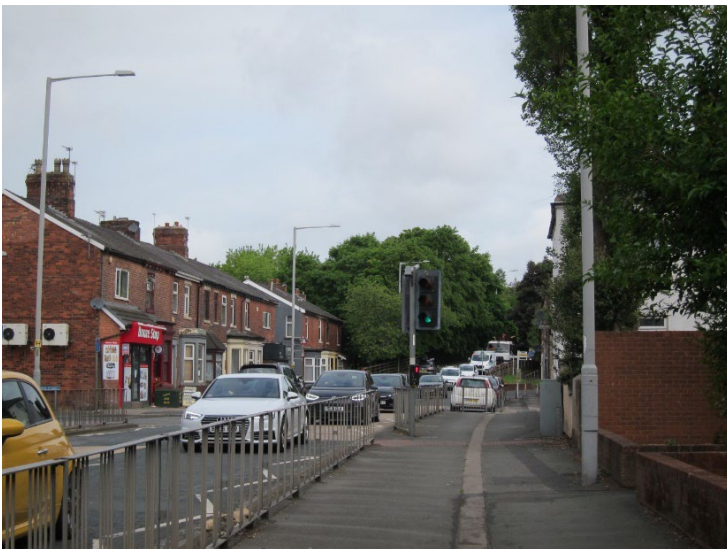
Photo 8: AM, Looking North up Watkin Lane (B5254 – becomes Leyland Road further North) adjacent to Ward St. Queue extends over the railway towards Tardy Gate – Coot Lane/Brownedge Road staggered junction.