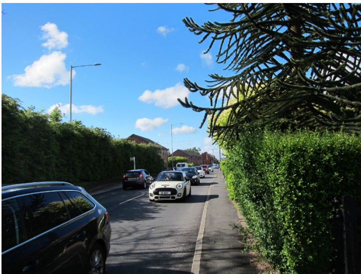
Photo 1: PM, Looking North from Bee Lane Roundabout. Queuing Southbound towards Bee Lane/The Cawsey.

All of the following photographs were taken 24/05/22 where traffic remains influenced by Covid19.