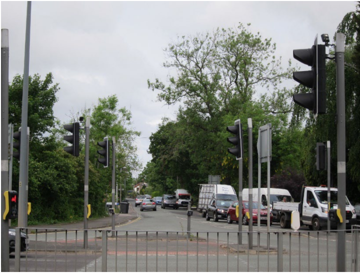
Photo 9: PM, A582/Chain House Lane junction view of traffic egressing on to A582 Penwortham Way.