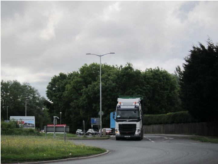
Photo 15: PM, Croston Round Roundabout traffic emerging from Lancashire Business Park (Centurion Way)