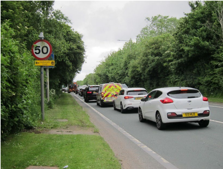
Photo 12: PM, Brook Lane (G S U Landscapes), looking North up A582 Penwortham Way towards Chain House Lane.